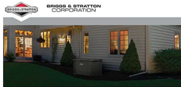
Briggs and Stratton Installation Program